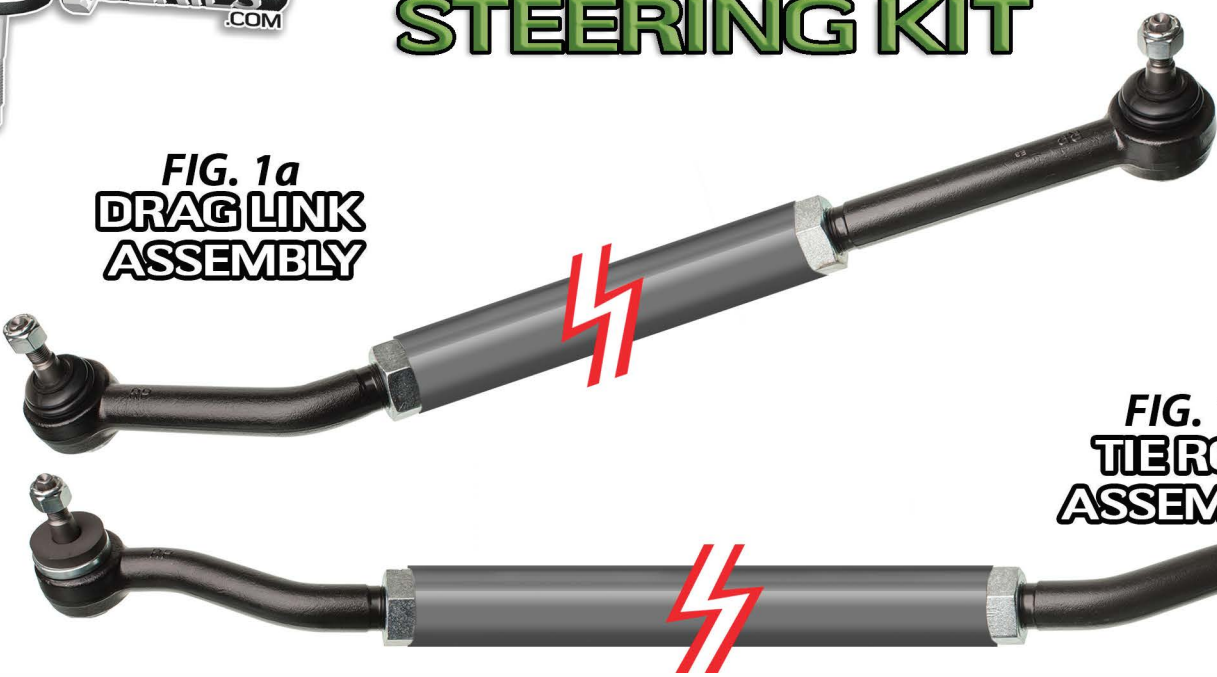
FIG. 1b TIEROD ASSEMBLY